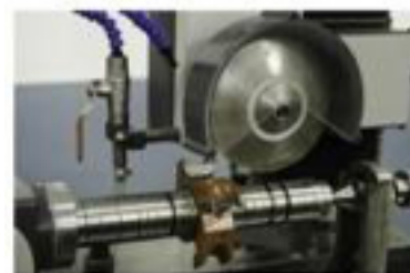
Precise grinding with hydraulic right-left table movement.