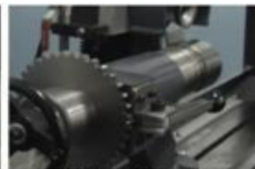
Specially designed for tools with PowerLock system.